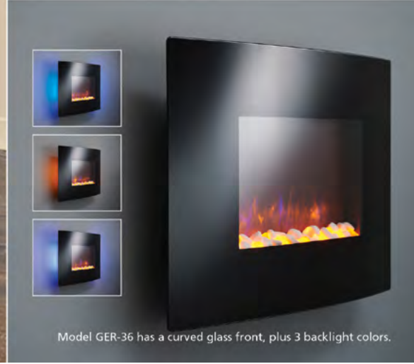
Model GER-36 has a curved glass front, plus 3 backlight colors.

This hot fireplace feels cool to the touch, yet puts out heat when you want it. It hangs like a piece of art – easy to install and set up. Place it on any interior wall with an electric outlet. Just plug it in and have a beautiful fire. All linear models are flat, except the GER-36, which has a curved glass front.