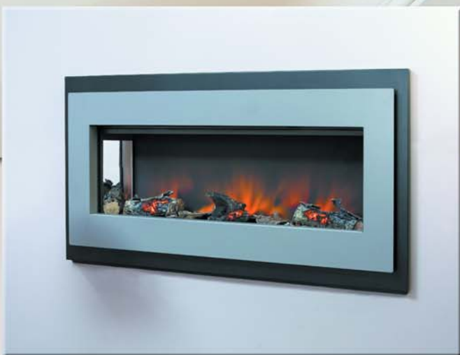
OMNI ARGENTO Electric Fireplace